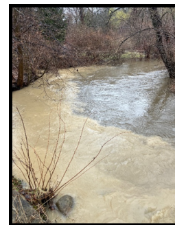
Impact to Paint Creek

The Township is working in collaboration with the Road Commission for Oakland County to secure funding for this crucial project. Currently, funding is available to cover 50% of the total project costs, but we still need to secure the remaining 50%. The total estimated cost of the project is approximately $6,000,000, which includes paving about 4,800 feet of East Clarkston Road and implementing the necessary stormwater treatment measures. The Township is seeking an additional $3,000,000 to complete this project.