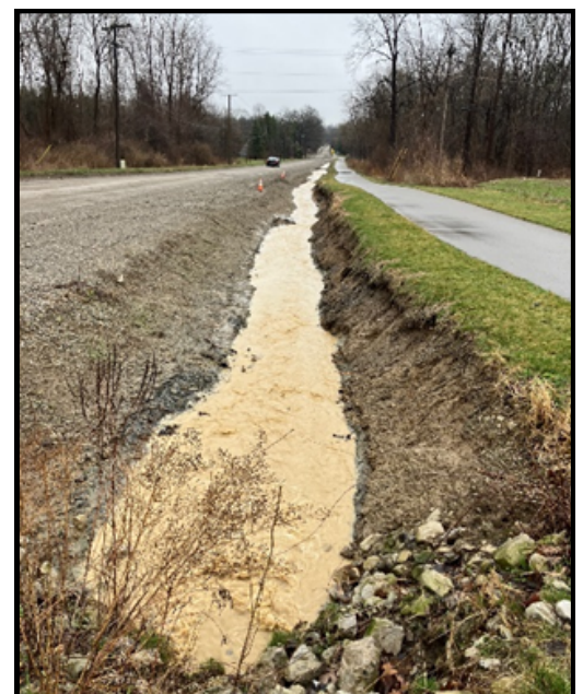
Roadside ditch along East Clarkston Road