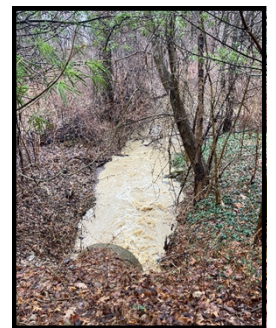
Discharge to Paint Creek